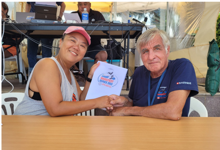
Discussion for organizing the next competition (Jul, 2023)

(Chairlady of Chinese Taipei Waterski & Wakeboard Federation)