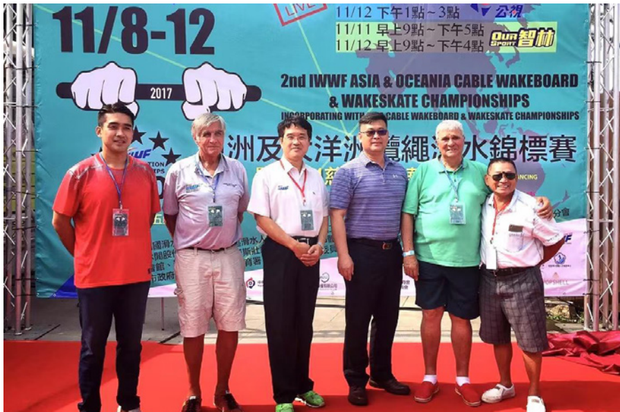
2017 2 nd IWWF Asia & Oceania Cable Wakeboard & Wakeskate Championships