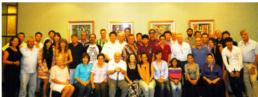
IWWF Delegates in recent years