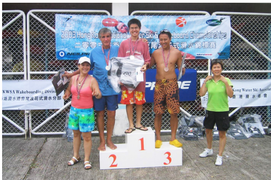
2003 Hong Kong National Water Ski & Wakeboard Championships