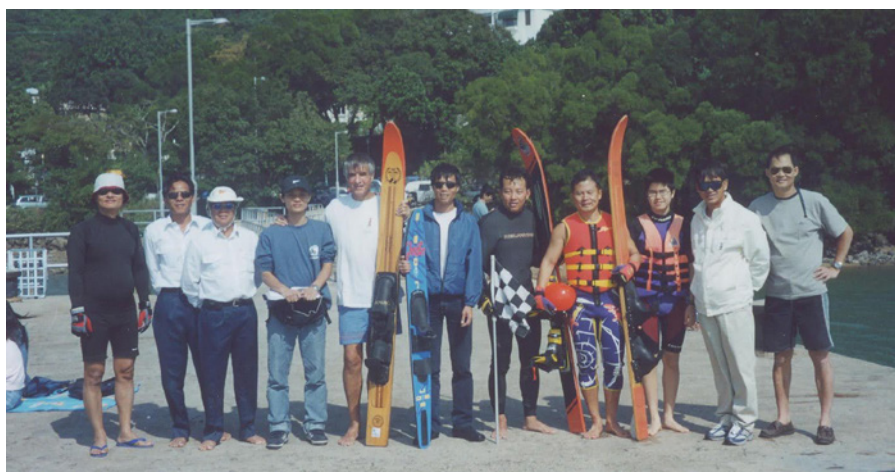
2002 Ski Racing Competition