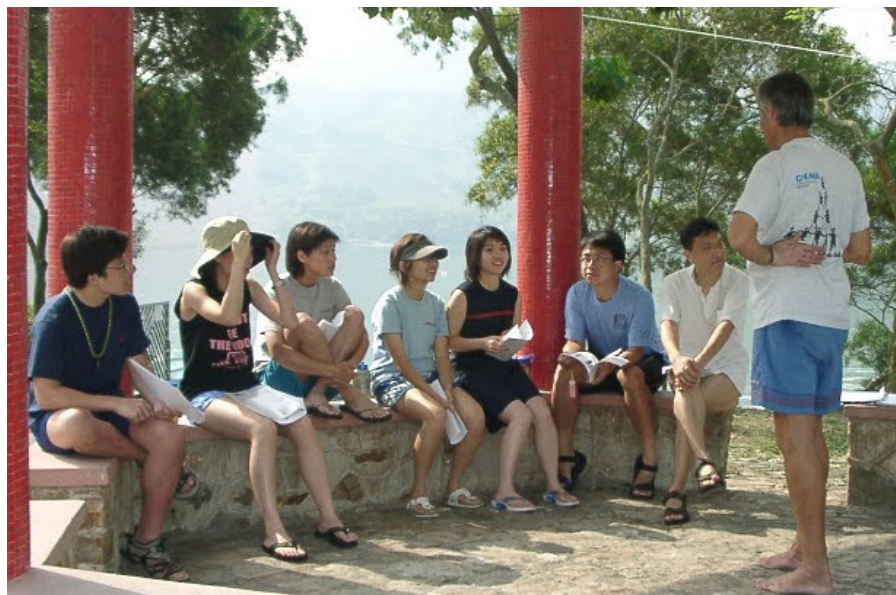
Coaching during the Beginner Training Course