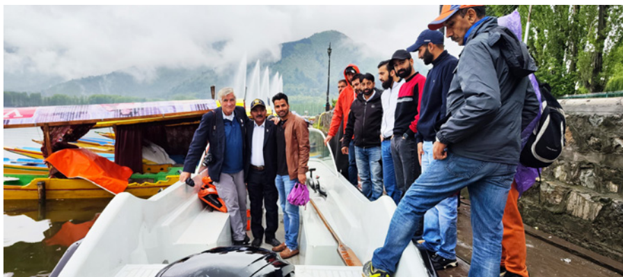
With the Waterski Association of Jammu and Kashmir, Lake Dal, Srinagar in 2023