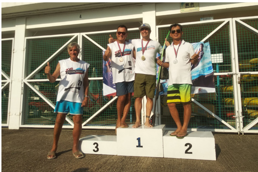
Prize Presenting 2019 Hong Kong Open Water Ski Championships