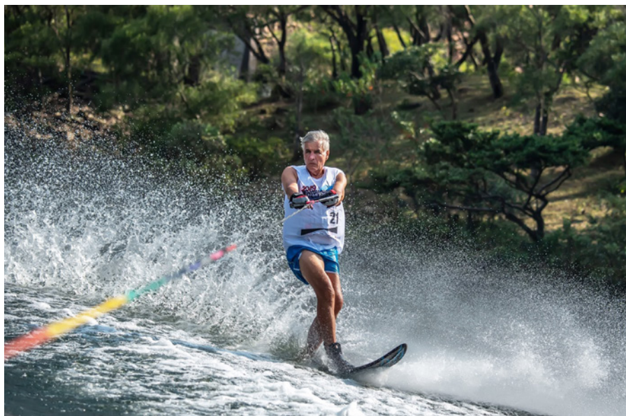
Skiing during 2019 Hong Kong Open Water Ski Championships