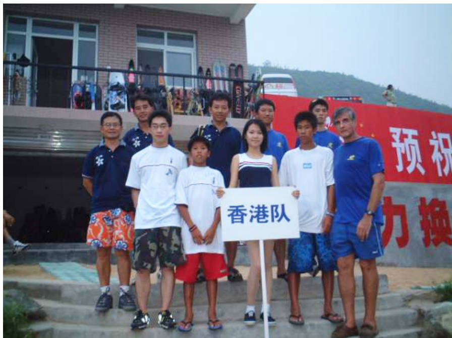
Team Photo during 2002 China National Waterski Championships