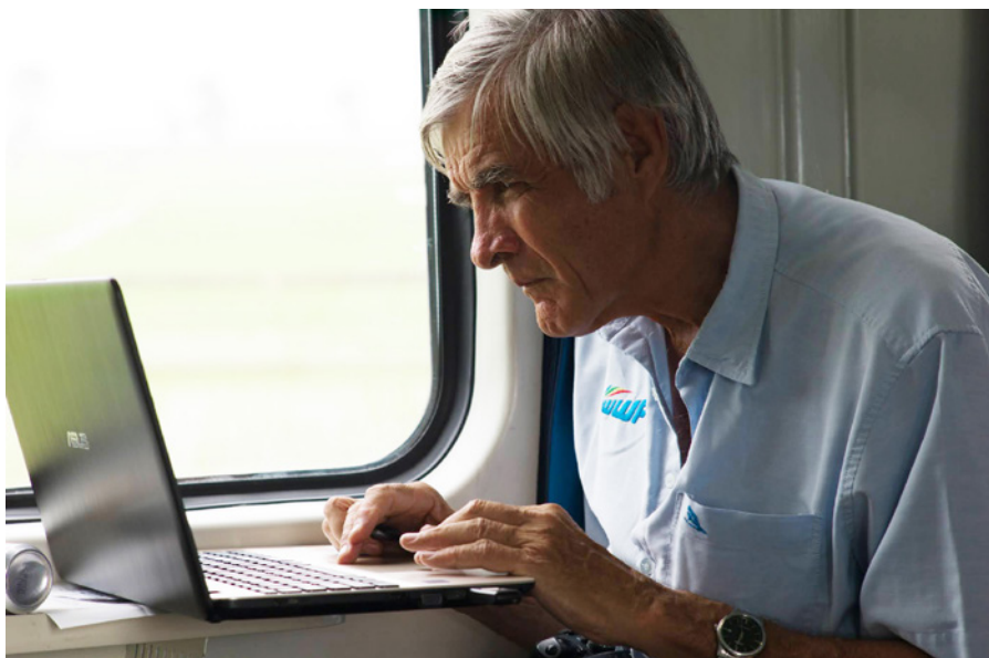
On a train to China in 2017 for IWWF Event