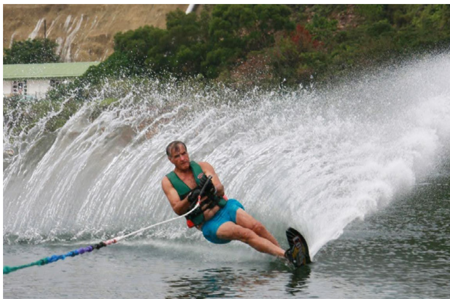
Skiing in one of the competition in 2000s