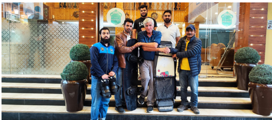
Presenting wakeboards to the Indian Jammu & Kashmir Waterski Association in 2023