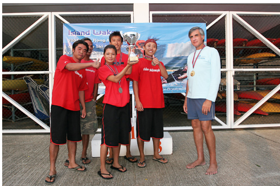
Presenting Team Award during Island Wake 2005 Hong Kong National Open Water Ski & Wakeboard Championships