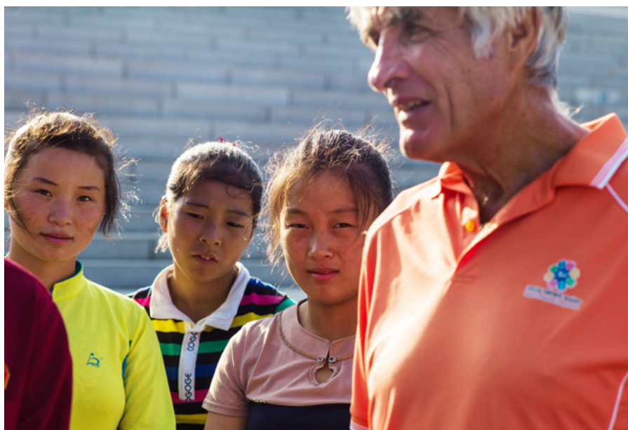
Photos during IWWF Coaching Clinics in Pyongyang in June 2017