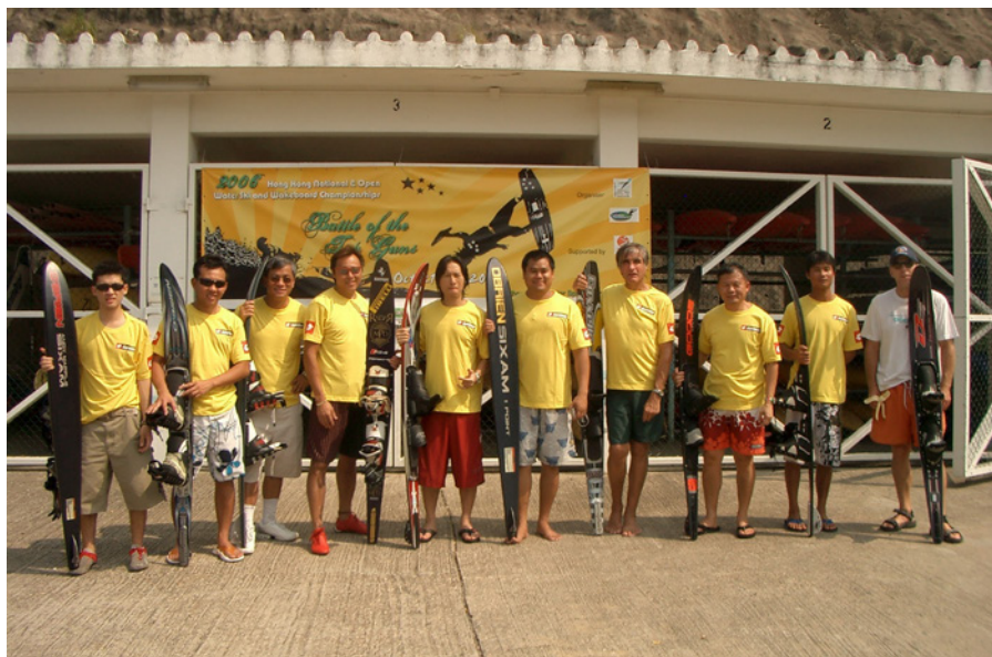
2006 Hong Kong National Waterski and Wakeboard Championships