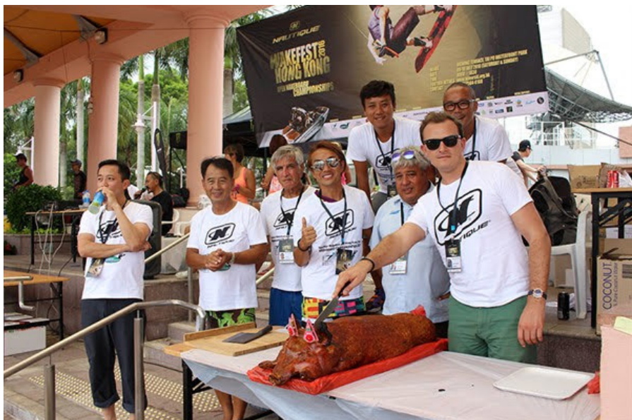
2016 Nautique Wakefest Hong Kong