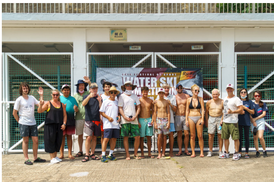
64 th Festival of Sports – Water Ski Competition in 2021