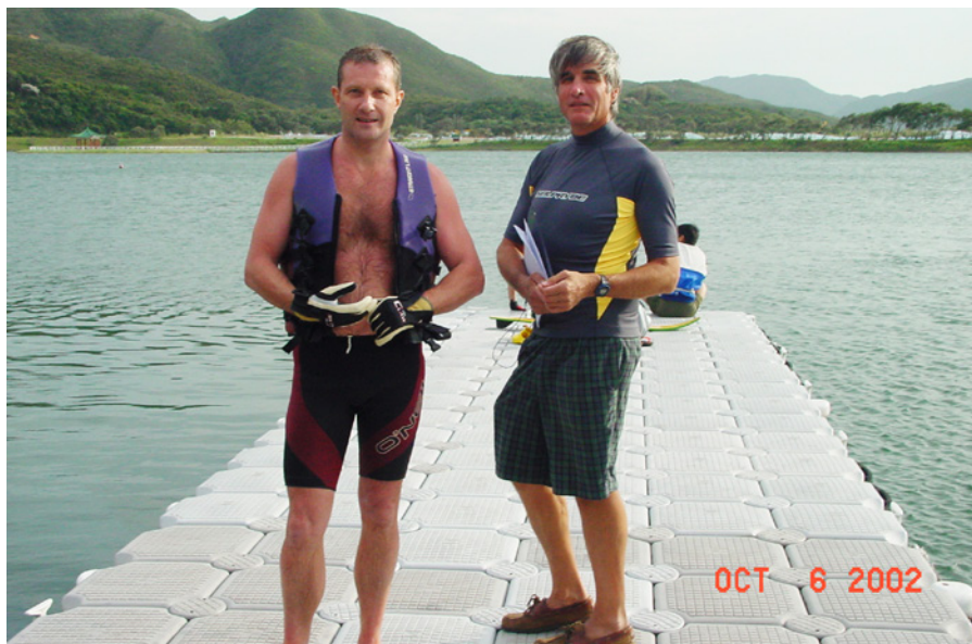
Coaching during the Beginner Training Course