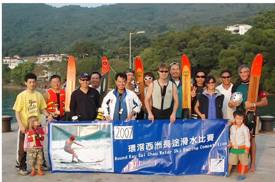
2007 Round Kau Sai Chau Water Ski Racing Competition