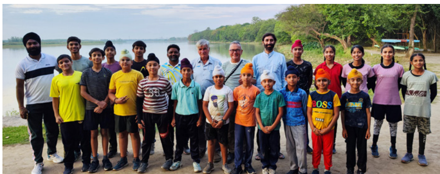
Training Camp in Chandigarh, India in 2023