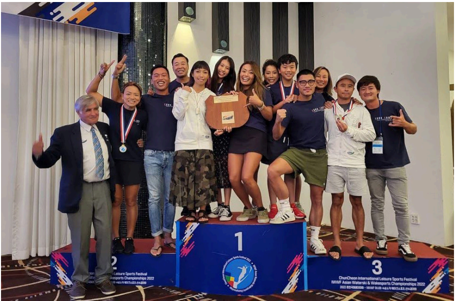
Team Photos with Hong Kong Team during the IWWF Asian Waterski & Wakesports Championships 2022