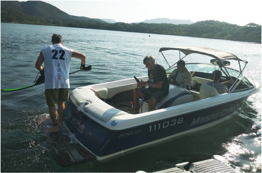
Preparing the handle during 2019 Hong Kong Water Ski Open Championships