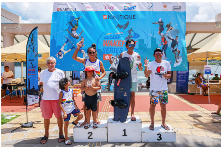
Presenting award during Nautique Wakefest Hong Kong 2023