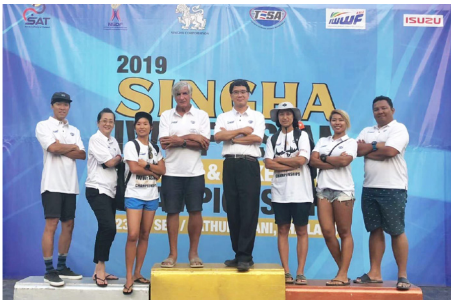
Technical Officials of the 2019 Singha IWWF Asia Waterski & Wakesports Championships