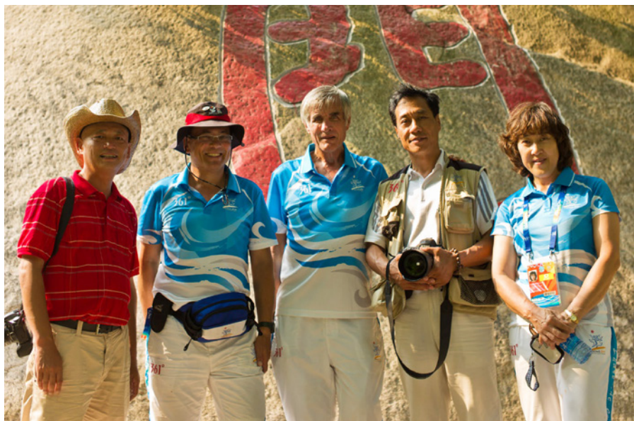
Asian Beach Games, Haiyang, 2012