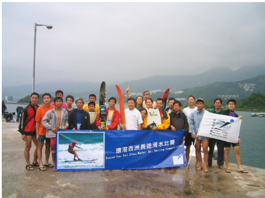
Skiing in one of the competitions in 2000s